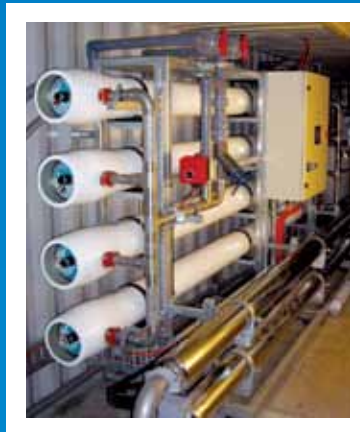
Gorgon LNG Project Barrow Island