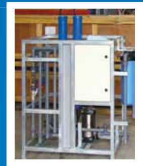
Water Treatment Supply in Hotels & Resorts