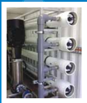
Boiler Feed Water Pre-Treatment Containerised Unit