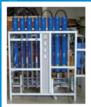
Skid-mounted Water Purification Unit