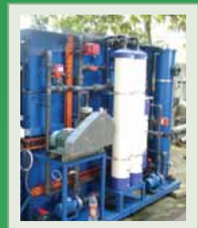
Decentralised sewage treatment plants enabling grey water recycling