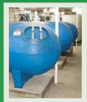
Site decontamination plant removing toxic substances from ground water