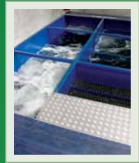
Containerised MBR for mine site accommodation camp