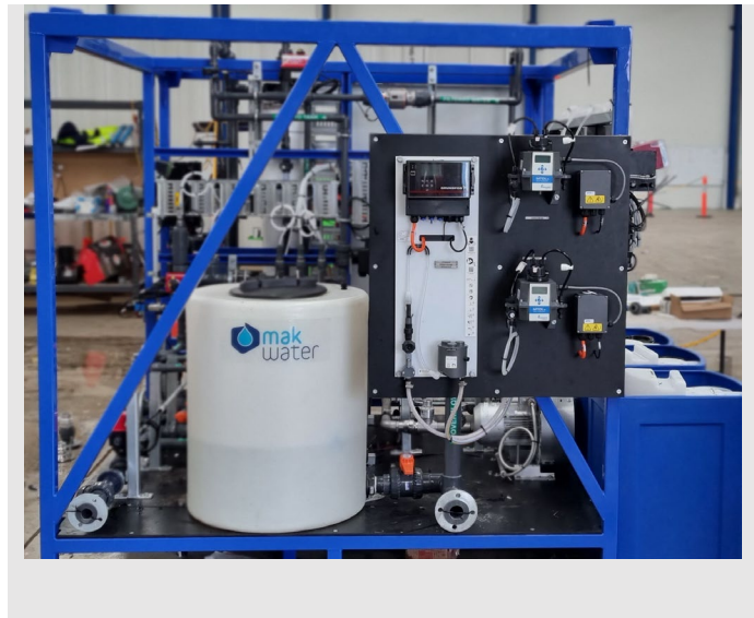
UF plant undergoing FAT in workshop