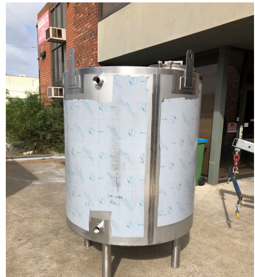
CIP tank in fabrication prior to testing and shipping