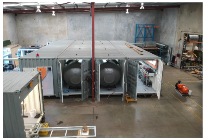
Aerial view of Multimedia Filtration (MMF) plant in MAK Water's Fabrication Facility